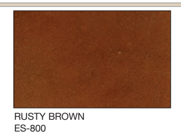
E-Stain Applied to White Overlay